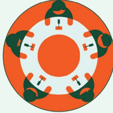
POLITICS AND PUBLIC ADMINISTRATION