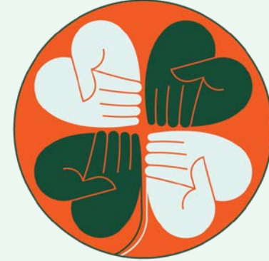
SOCIAL WORK AND SOCIAL ADMINISTRATION